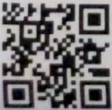
Table of Renewal